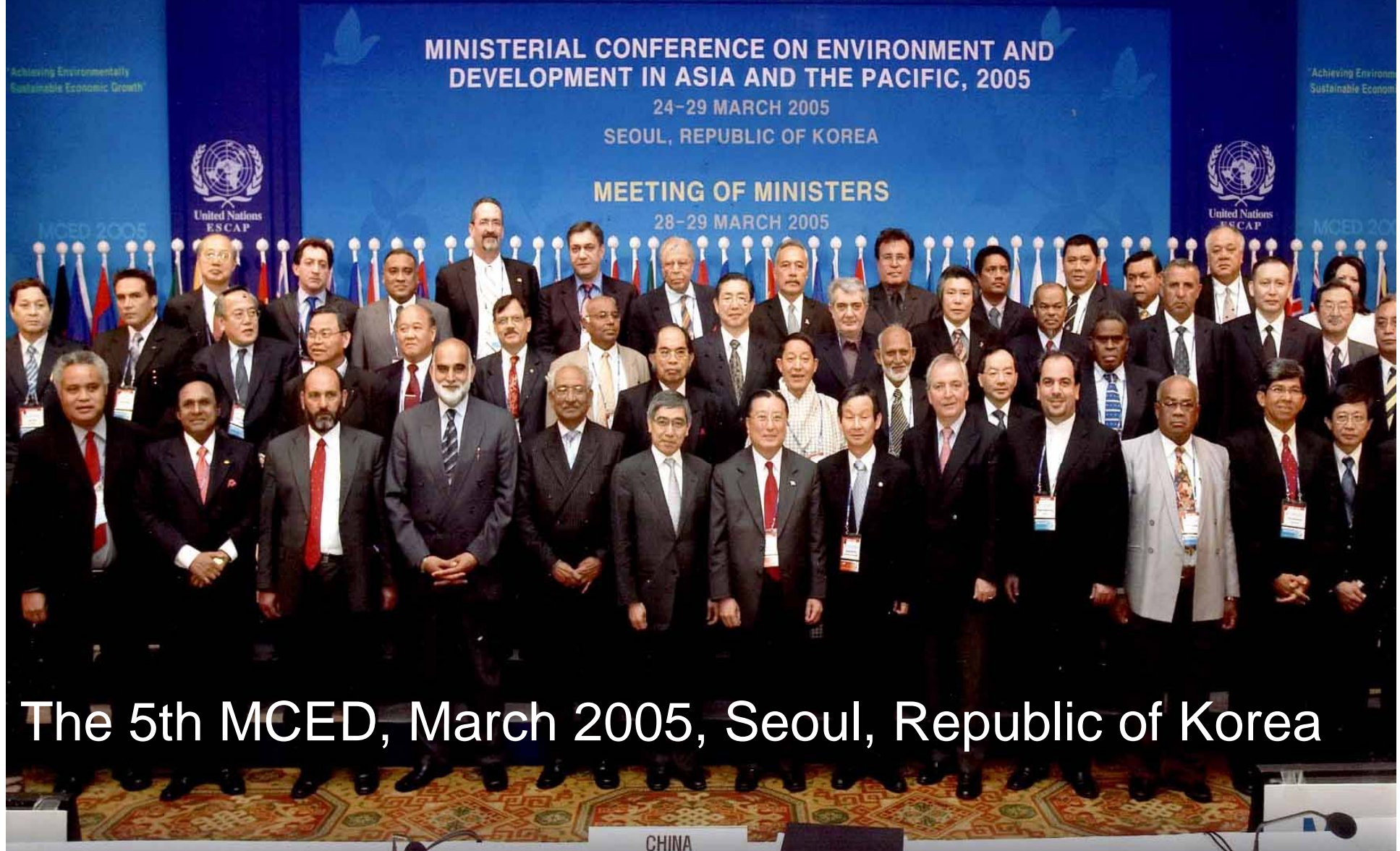
The 5th MCED, March 2005, Seoul, Republic of Korea